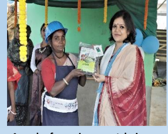
A pack of vermicompost being handed over by a community worker to Head-CSR, CESC Limited