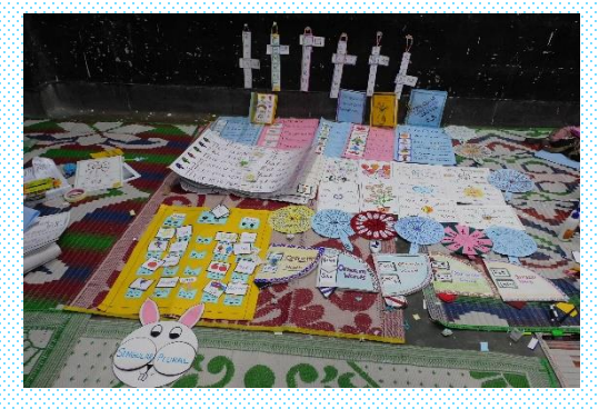
Some of the TLM's developed by teachers