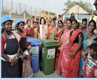
Dustbins being distributed to the community members