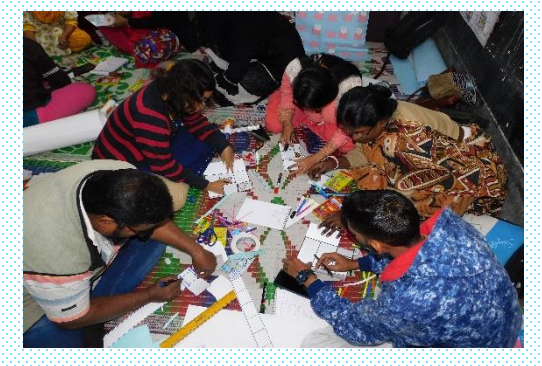
Teachers in the process of making TLM's

In December, 2022, teachers of Indradhanush Project attended a three-day training on pedagogy and use of teaching learning materials (TLM). The objective of the training was to form a group of Resource Teachers who will be able to disseminate the accelerated teaching method in a joyful manner to children of classes I and II. The training enabled the participants to ensure quality teaching in Bengali and English for classes I and II as per the guidelines of the Government of West Bengal. Through mock sessions, teachers also learned how to design, develop and use learning materials. A total of 12 teachers from various Special Training Centres and Child Assistance Centres under the Project, and 2 Project Staff participated in the training session.