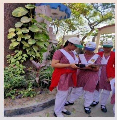
Students conducting an Air Quality Mapping

Under Urja Chetana Project, students of Putiary Brajamohan Tewary Girls High school, Kolkata conducted a comparative study on 'Indoor and Outdoor Air Quality Mapping' under the theme 'Improvement of Air Quality'. The spots were identified for comparisons and then parameters were measured through a portable devise and noted for comparative study and awareness within school and immediate neighborhood. Places where more plantations were present showed good air quality. This was highlighted by the students thus, stressing on the need to highlight and increase greening initiatives within schools and immediate neighbourhoods.