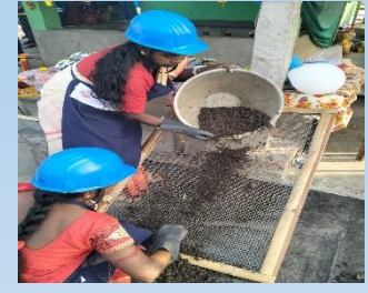
Compost being prepared for packing