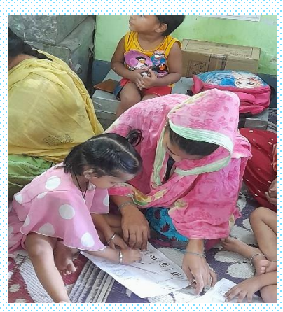
A child being provided support while doing a worksheet

generation and participation of the parents in learning process. A total of 97 children and their parents participated on that event held in November, 2022. The programme was made colourful with rhymes, songs performed by the small children and drawing pictures of flowers, birds and body parts which can further be used as teaching learning materials in the ECED centres. Also, mothers were sensitized about nutritious food in accordance with tricolour nutrition flag like saffron for lentils or oil, white for rice, milk or eggs, and green for leafy vegetables which are very useful for their children.